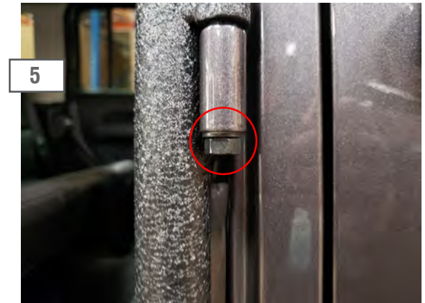
Install the new door, you may need to use a rubber mallet to seat the door all the way onto the hinge. Use the supplied M8 nut and washer to secure the door to the hinge.