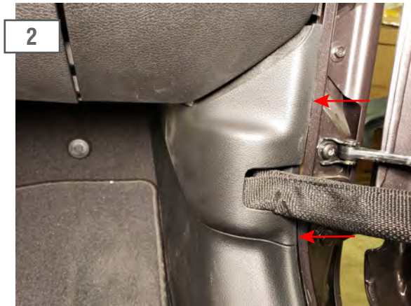
Using a panel removal tool, pry the kick panel off.