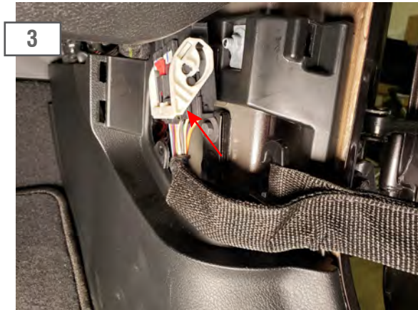
Roll down the windows so that the door is easier to handle while removing it from the vehicle. Unplug the connector. Slide the hinge strap off the chassis mount.