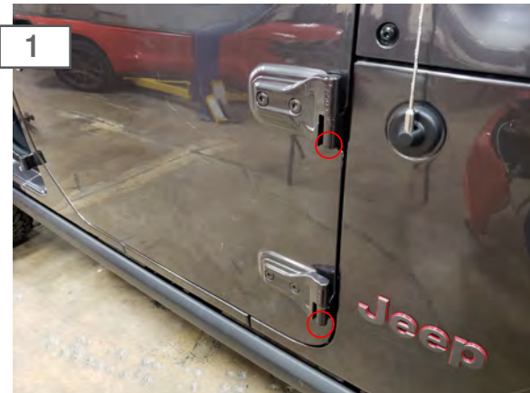
Begin by removing the T-50 Torx nuts on the bottom of the factory door hinges. These will not be reused.