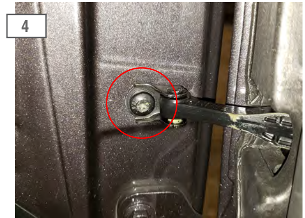
Locate, and remove the T40 torx bolt securing factory door hinge stop. Lift the door up to remove it from the vehicle. Then reinstall the factory T40 torx bolt as a place holder to ensure it doesn't get lost.