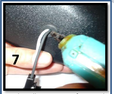
Gently pull excess wire from pods. We recommend sealing any air-space around wires with glue gun.