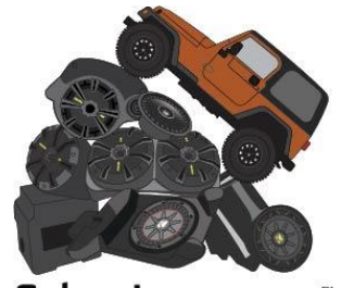
There is a video of this on our website and on youtube.com

'97-'00 models now check the pods for fitment...may need to use a pair of pliers or vice grips to slightly bend the corners back and away if these points are interfering with the pod(s) installation after making the cuts. Then go to step #13 on other side of page.