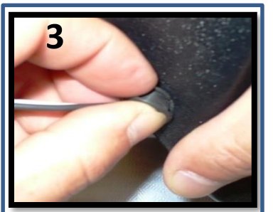
Feed the spade terminals through the 7/16" hole on back of each pod and push grommet into hole.

Push grommet over each pair of plugs starting with the large spade first. It's a tight fit, but it minimizes hole size.