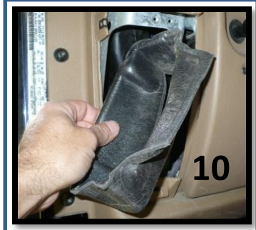
Remove foam pieces if your TJ has them.