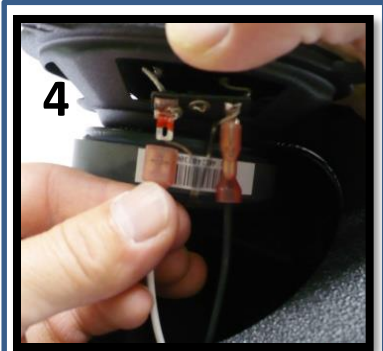
Connect spade terminals to speakers.

Gently push speaker spade terminals inward toward the magnet if needed for wall clearance.