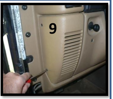
Remove the speaker covers from your TJ's dash with a Phillips screwdriver, 2 screws per side.