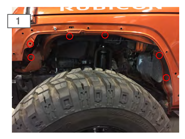
Locate the mounting locations on the fender well.