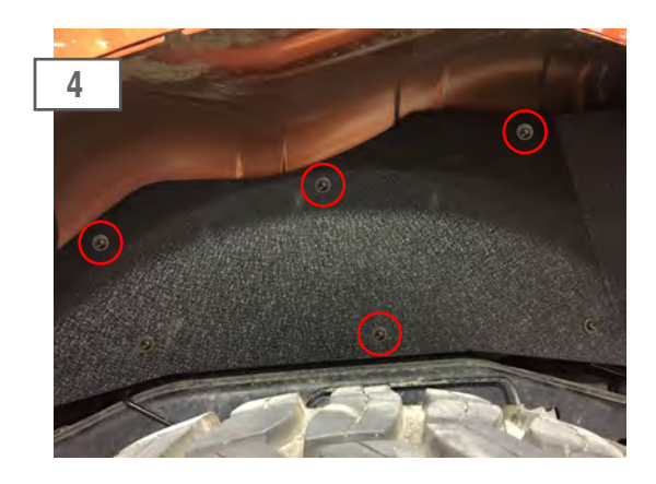
Install the supplied screws/small washers into the remaining holes.