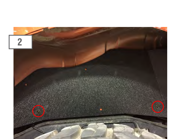
Secure the rear fender liners using the supplied Allen bolts. **Note: The large washer goes on the tire side of the liner. The small washer goes on the chassis side of the washer.