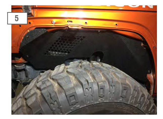
Install fender liners using the supplied bolts, lock washers, and large washers.