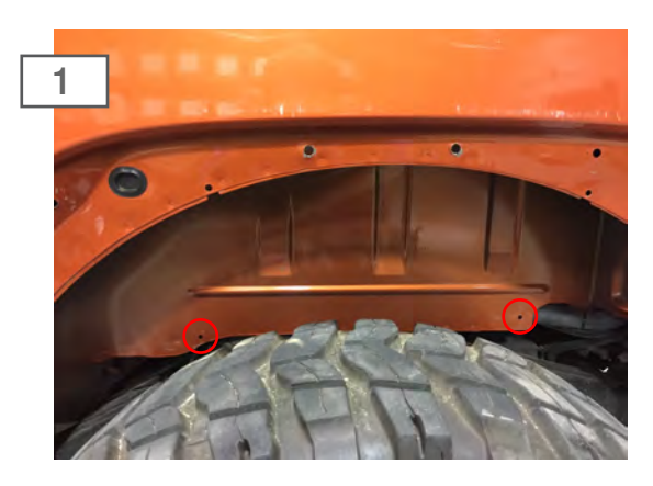
Locate the factory mounting locations on fender well.