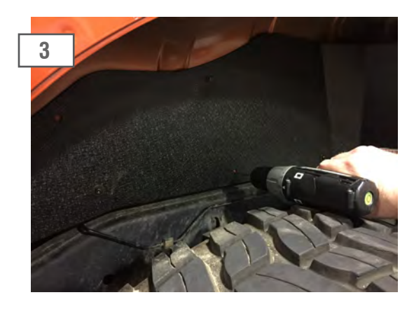
Mark the remaing holes for drilling. Drill a pilot hole using a 1/8" drill bit. Then drill a 5/32" hole.