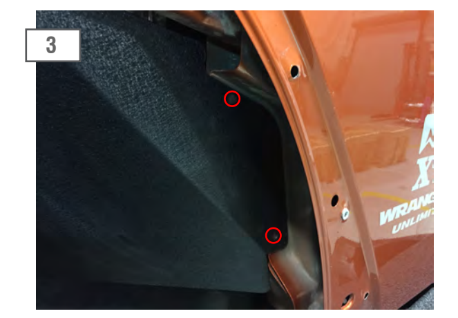
Loosely install the inner fender liner using the supplied Allen bolts. Using a marker, mark the hole locations on the rear most holes. These will need to be drilled. Remove the fender liners. Tighten the factory 10mm nut now that the bracket is in the correct location.