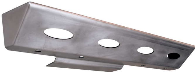
17-59-030 JK Brawler Lite Front Skid Plate

These installation instructions apply to the following Poison Spyder products: