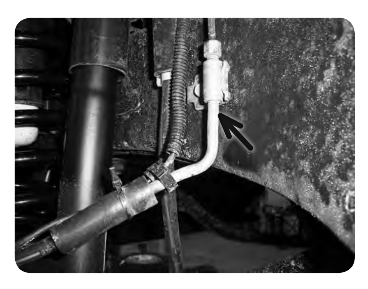
Figure 6B - After