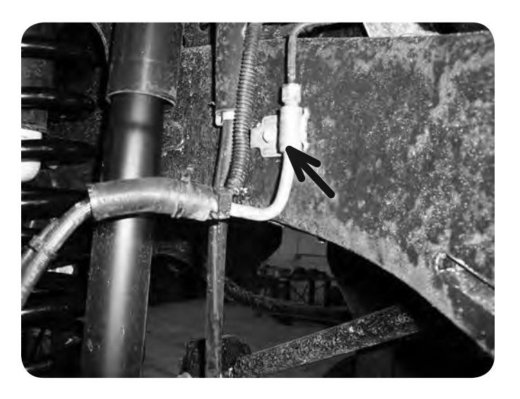
Figure 6A - Before