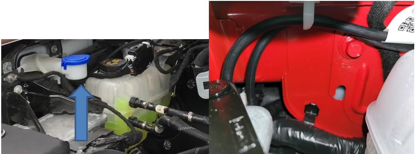
Figure 3 - Passenger side bolt location near coolant reservoir

Step 4 – Locate passenger side lower bracket bolt location. It is located near the coolant reservoir along the inner fender. Loosen the bracket bolt and place the “R” fender bracket on the bolt as before. Tighten down the bolt so the fender bracket is flush and in place.