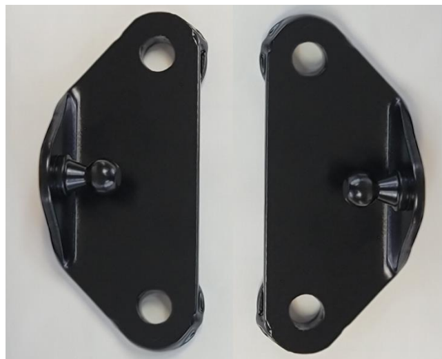
Figure 4 – Passenger side and Driver side Hood Bracket orientation

Step 5 – Begin to loosen the passenger side hood bracket nuts. Remove both nuts and slide the hood bracket mount on the threaded bolts on the hood. Replace original nuts and tighten down. The Ball stud will be facing inward when placed correctly.