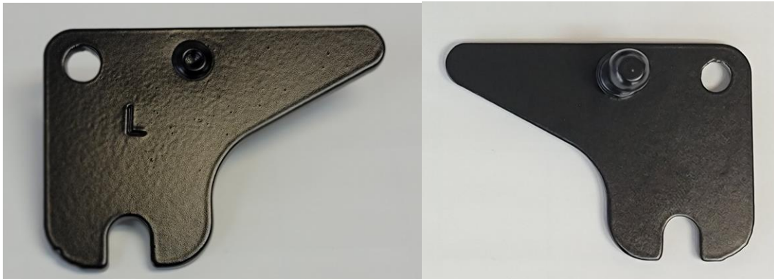
Figure 2 – Back and front sides driver side fender bracket.

Step #2 – For the driver side fender bracket use the bracket marked “L” and for the passenger side use the fender bracket marked “R”. Slide the “L” bracket over the exposed threads of the loosened bolt. The ball stud should be facing inwards towards the engine bay while the flat back side should be held flush to the fender.