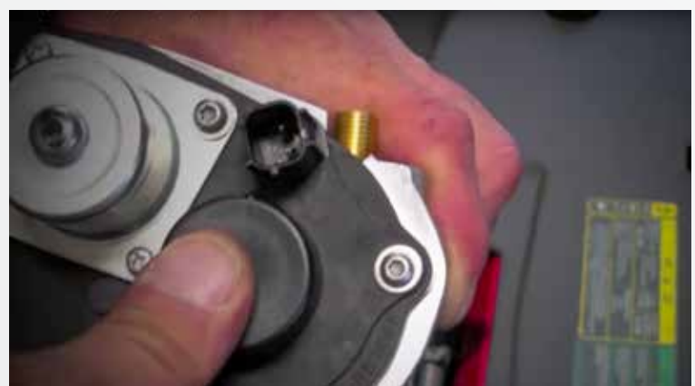
Align the tabs on the removable cap with the slots on the motor housing and snap it into place.