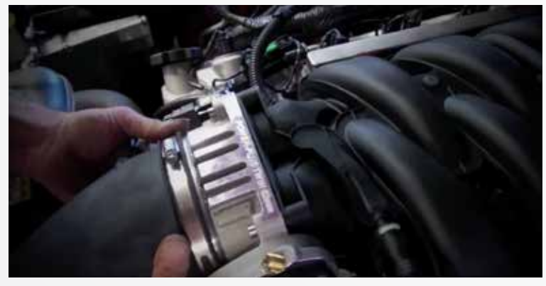
Re-install the intake hose and re-attach the PCV tube.