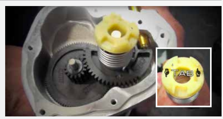
Place the plastic capped spring over the end of the throttle shaft of the BBK throttle body and line the pigtail hook on the spring up with the catch slot in the gear.