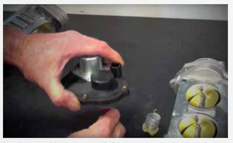
Pop the removable circular cap off of the motor housing. (This is easily done with a finger or tool).