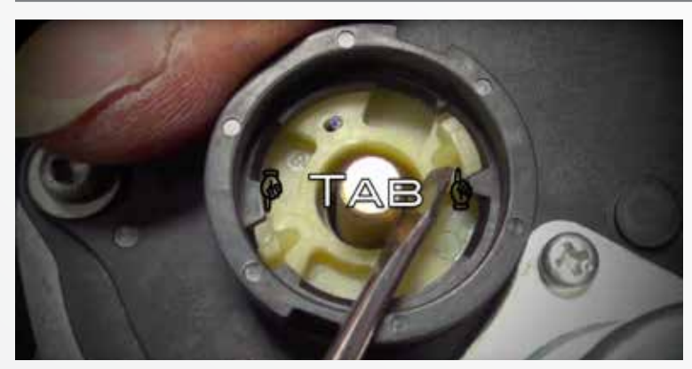
Using needle nosed pliers or screw driver rotate the plastic spring cap COUNTER-CLOCKWISE (approximately 180°) until the 2 tabs line up with their matching landings in the motor housing, then gently pull up on the cap until it pops up into a latched position.