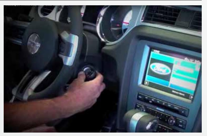
Turn the ignition to the ON position but do not start the car.