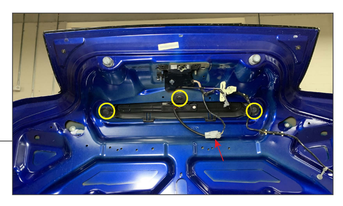
Remove (3) plastic push clips from the vehicle third brake light assembly. Remove the brake light assembly from the vehicle.