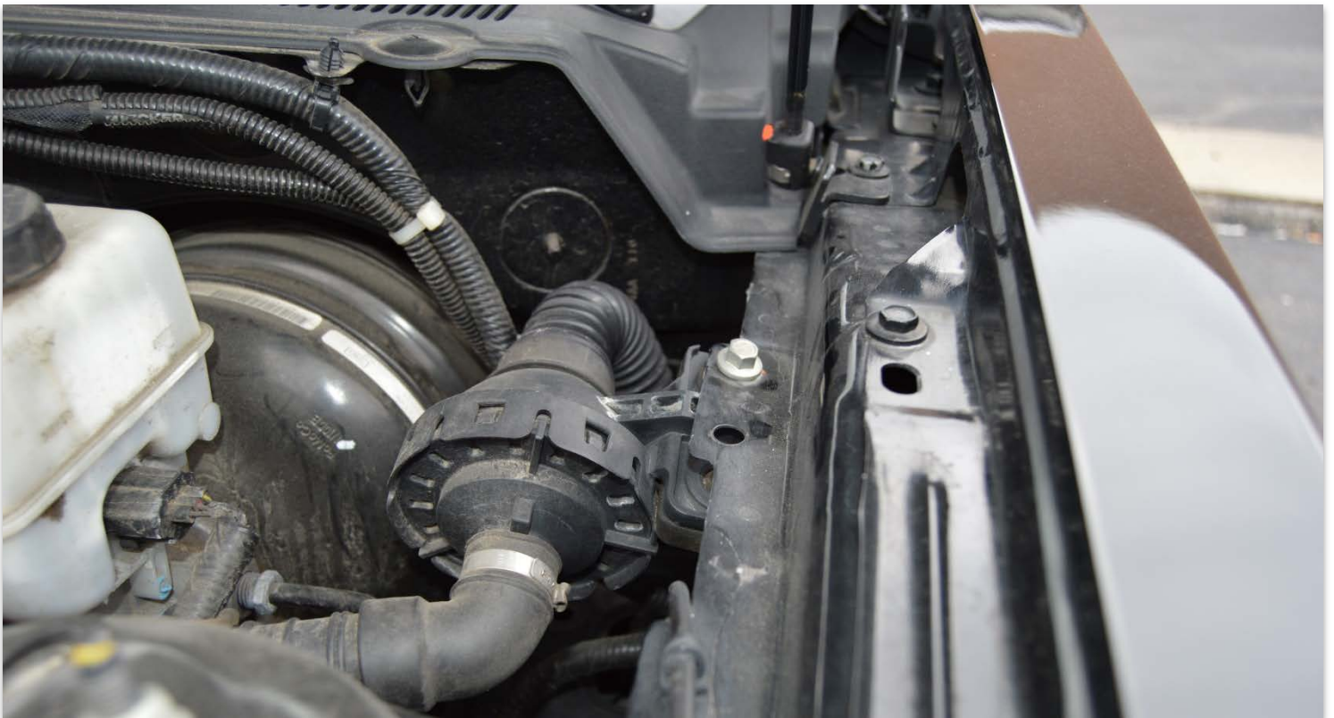
View of sound canister after relocation:

MRT appreciates your business; please feel free to contact us at any point with questions or concerns at 734-455-5807 or via email at Sales@MRT-Direct.com